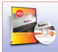
Parts Identification Software

To enhance uptime the Pyramax is supported by BTU's 24-hour, 7-Day Worldwide customer support, electronic user documentation, and Parts Identification Software which allows customers to identify parts without the use of a cumbersome paper manual.